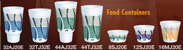
32AJ20E 32TJ32E 44AJ32E 44TJ32E 8SJ20E 12SJ20E 16MJ20E