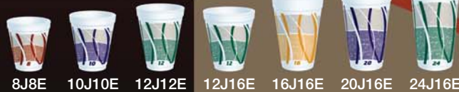
8J8E 10J10E 12J12E 12J16E 16J16E 20J16E 24J16E